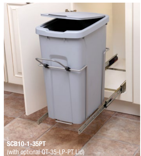
SCB10-1-35PT (with optional QT-35-LP-PT Lid)