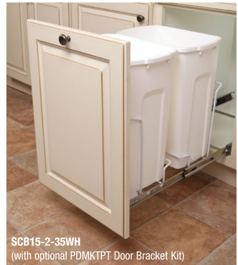
SCB15-2-35WH (with optional PDMKTPT Door Bracket Kit)